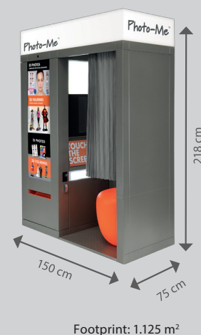
Footprint: 1.125 m²